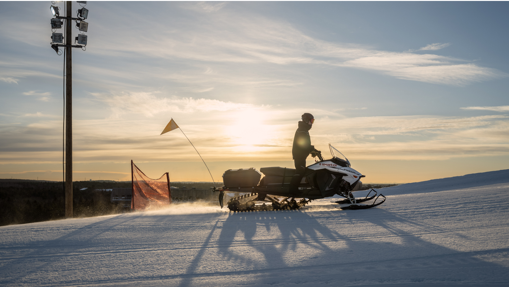
Electric Scooter Hammarbybacken