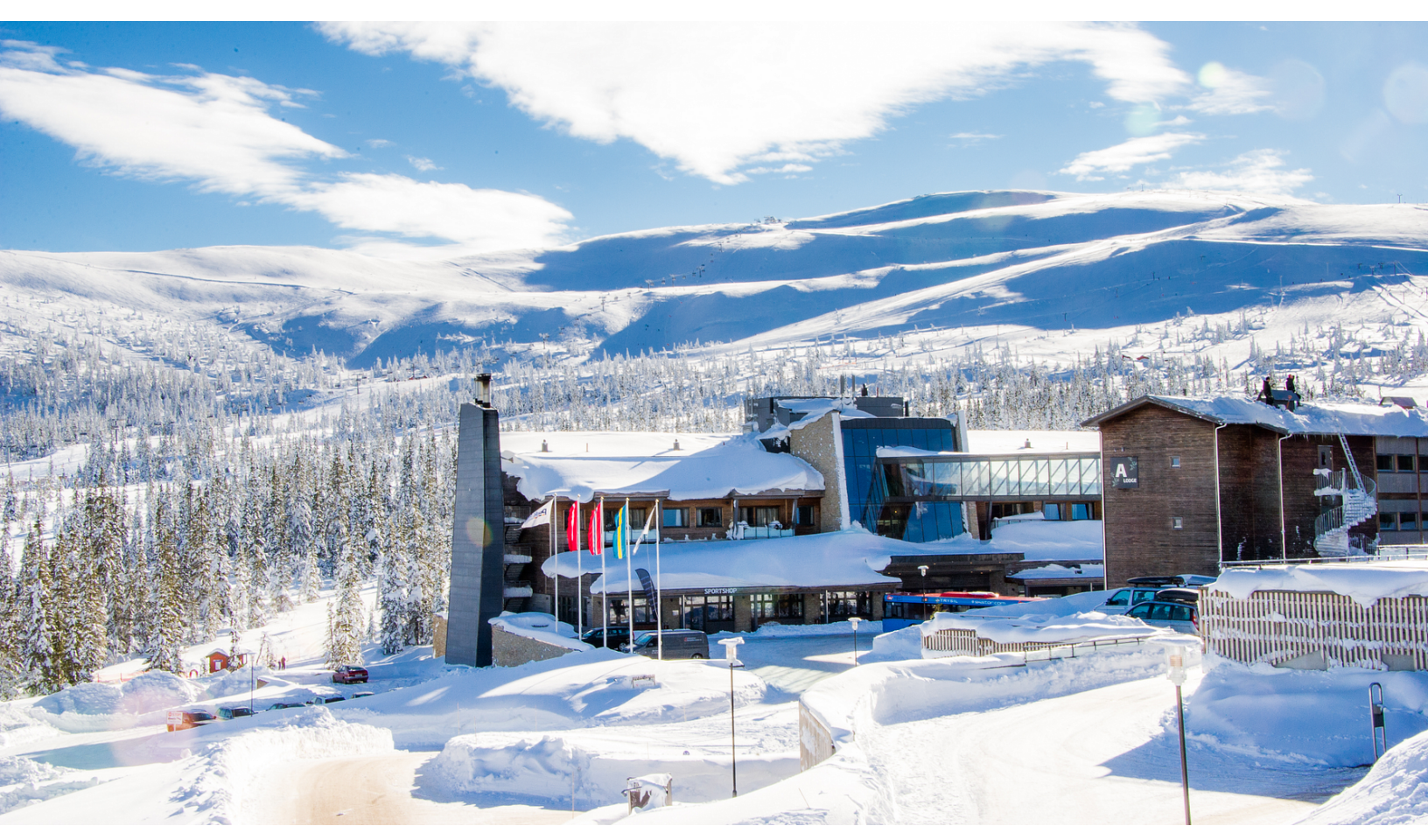
Radisson Blu Mountain Resort & Residences in Trysil